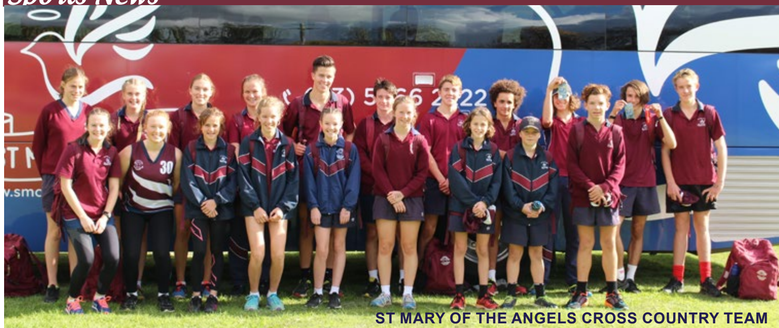
ST MARY OF THE ANGELS CROSS COUNTRY TEAM