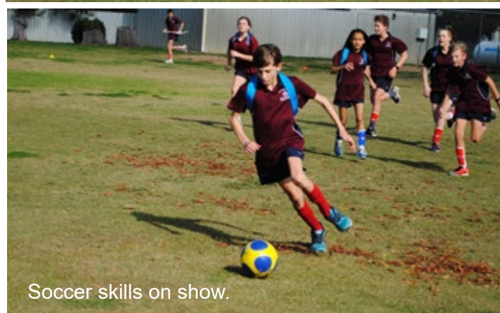
Soccer skills on show.