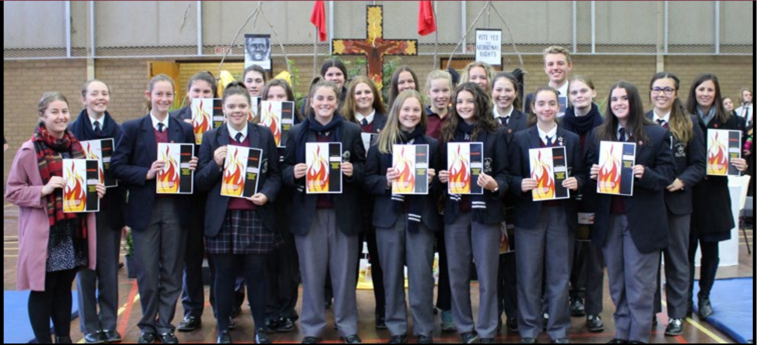
'Friends Igniting Reconciliation through Education' (FIRE) Carriers seek to keep the flame for Reconciliation alive in schools and the broader community.