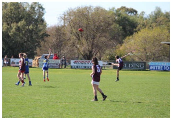
Pictured above: Year 7 Football action against Bendigo South East at the Rochester Football Oval.