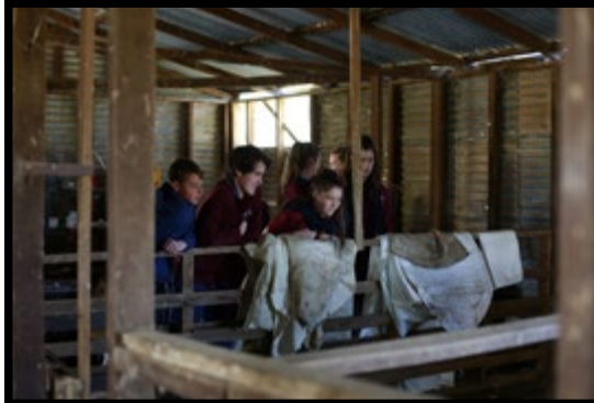
Pictured above: Year 10 Ag/Hort students with members of the Sheep and Cattle Showing team outside O'Hare's shearing shed.

Students learned about the techniques associated with shearing as well as wool handling.