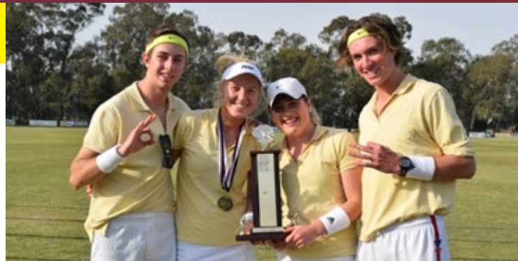
ST FRANCIS HOUSE CAPTAINS