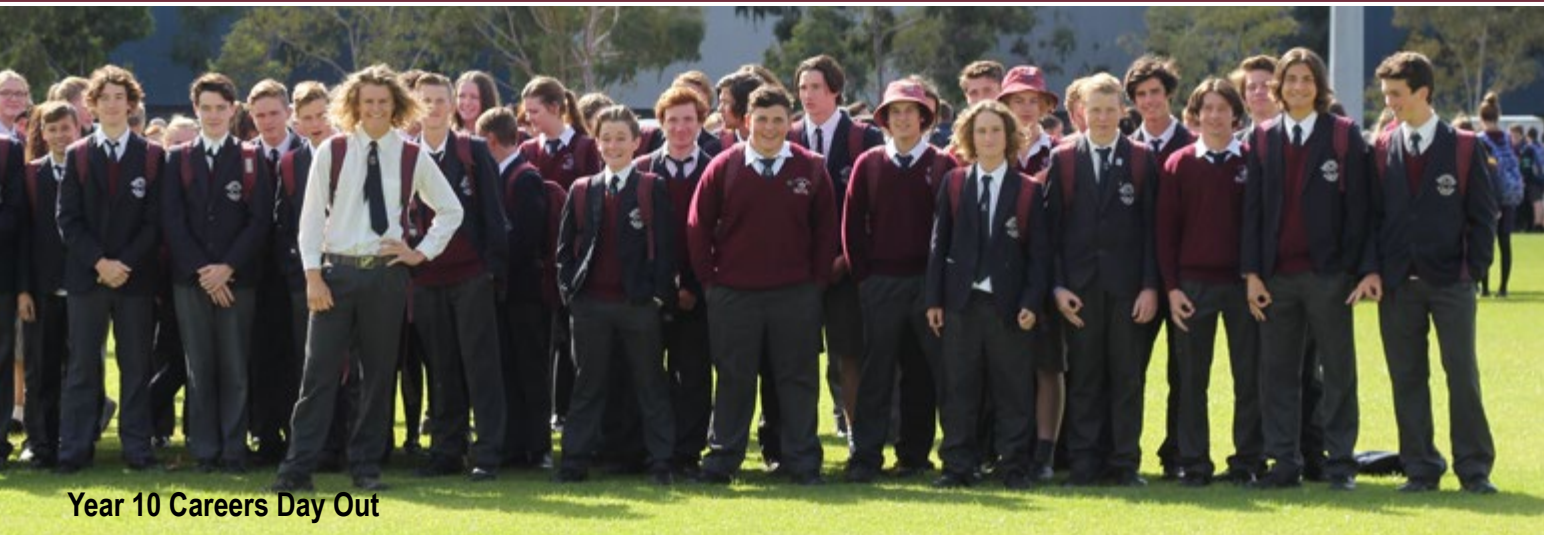
Year 10 Careers Day Out