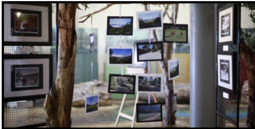
Examples of the great work by our Photography students currently on display at the Barmah Forest Heritage and Education Centre.

The St Mary of the Angels' Student Photography Exhibition will be on display to the public at the Barmah Forest Heritage and Education Centre in Nathalia until Thursday 10th August. Entry is free and everyone is welcome.