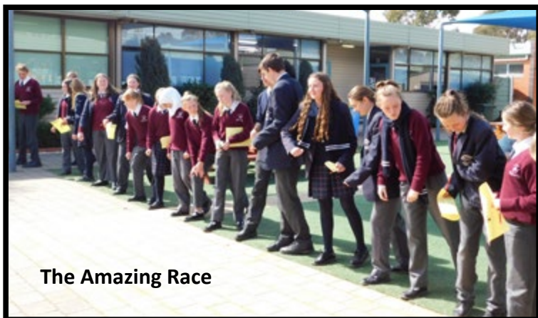
The Amazing Race