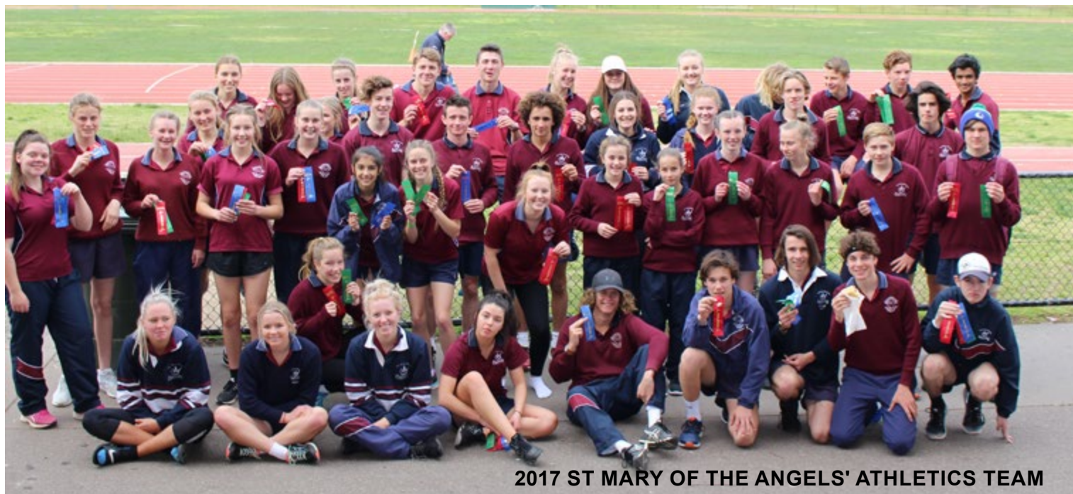
2017 ST MARY OF THE ANGELS' ATHLETICS TEAM